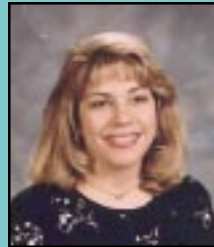
Sherrie Collins Louise Oakley Scholarship $1250