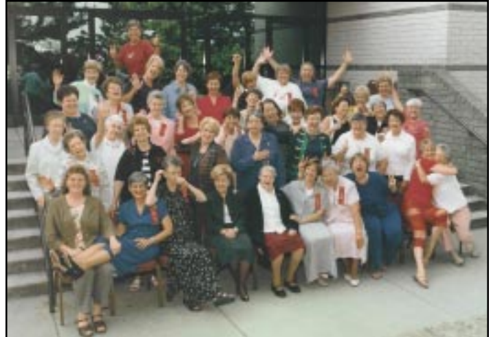
See?! We keep telling you that we have fun at regional conferences! And you think we just go to meetings! A lot you know!