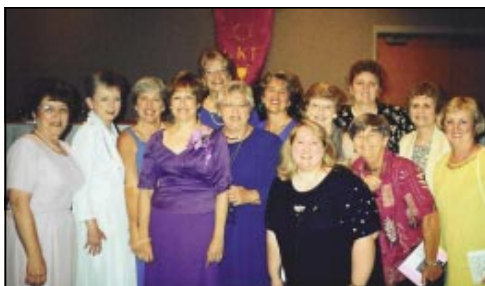
Far left: What are they up to? Don't even ask!