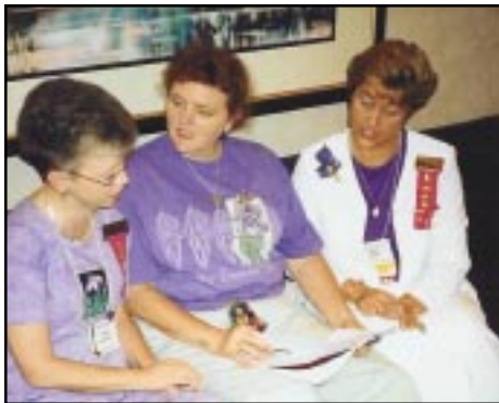
Now, which workshop are we going to next?