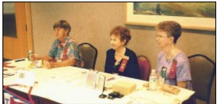
Working the sales table--super-duper salesmen help us earn nearly $2000!