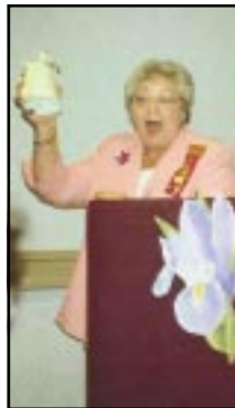
An angel! For me?!