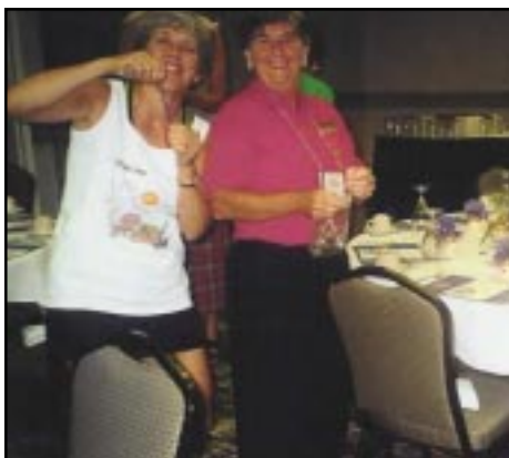
6 Xi State News September 2003